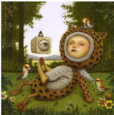
“Good Samaritan” by Naoto Hattori

The Other Evangelical Evangelical United Church of Christ