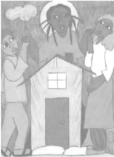
Sermon on the Mount Gallery