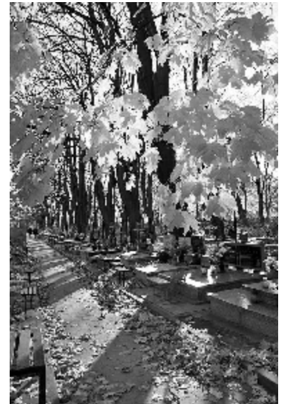
“Before All Saints Day” by Wlodek Juszczak

The dead shall rise again Whoever say Dust must be dust Don't see the trees Smell rain Remember Africa Everything that goes Can come Stand up Even the dead shall rise