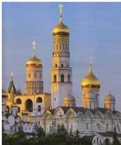
Pictures from Baptist Church (Atlanta), Vatican City, Bethel Mennonite Church, Pentecostal Church Salvador.