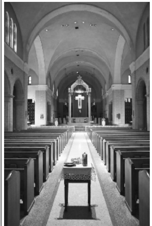
Bread and Wine, Darrell Storts